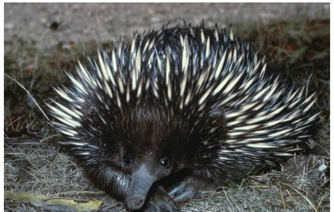
Figure 1. Short-beaked Echidna

The front feet of the Echidna have five flattened claws, designed to dig burrows and tear open logs and termite mounds. Their hind feet point backwards enabling the soil to be pushed away when burrowing. They commonly use their back claws for grooming. The tail of the Echidna is very short and hairless underneath.